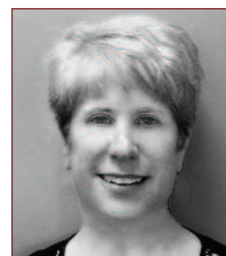
Stakeholder Perspective, page 386

Conclusion: An approach that uses a combination of strategies designed to impact patients' health-related behaviors across a variety of modalities may help to improve outcomes and reduce costs. Additional novel, innovative interdisciplinary initiatives are necessary to effect meaningful change that can facilitate improved health outcomes for patients with diabetes and maximize cost-effectiveness approaches for payers.